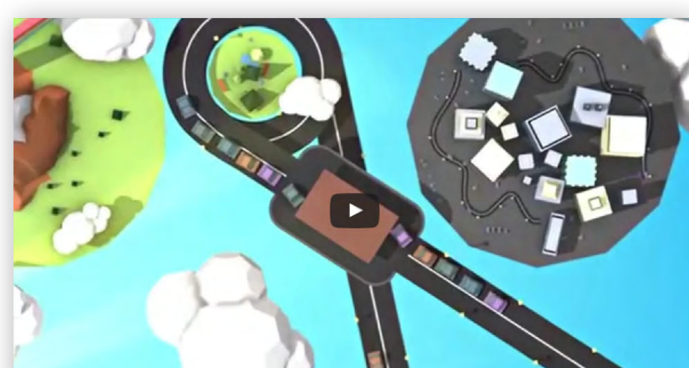
Click to open the video on youtube.com/fortechst

A smartSTATION is a service station you can manage remotely via a computer or smart phone. It never stops and features very small maintenance and blocking costs. It is a safe, reliable and performing service station. It can "manage itself", it is user-friendly because it is aimed at satisfying the end-users. In other words... it is smart!